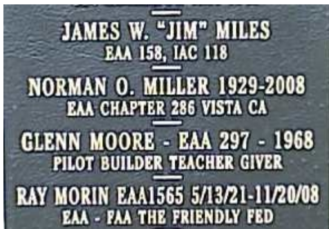
A Section of the Memorial Wall